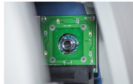
Integrated webcam for reporting of results