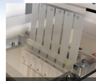
Automated Ag/Ab reaction contact